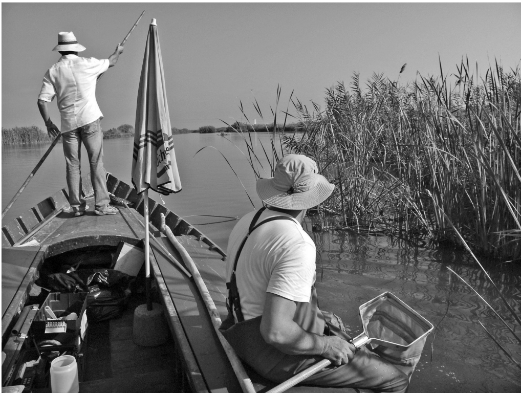
Figure 2. Sample site: AL04 (C. Molina). Estación de muestreo: AL04 (C. Molina).

Colony encrusting, delicate and transparent, composed by elongate, cylindrical autozooids forming dense clumps. Autozooids composed by a slender proximal portion, usually very short